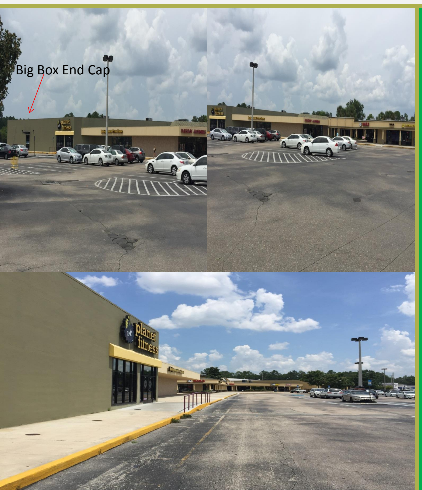
Although all information furnished regarding for sale, rental or financing is from sources deemed reliable, such information has not been verified and no express representation is made nor is any to be implied as to the accuracy thereof and is submitted subject to errors, omissions, changes of price, rental or other conditions, prior to assignment, of contract, sale, lease or financing or withdrawal without notice.